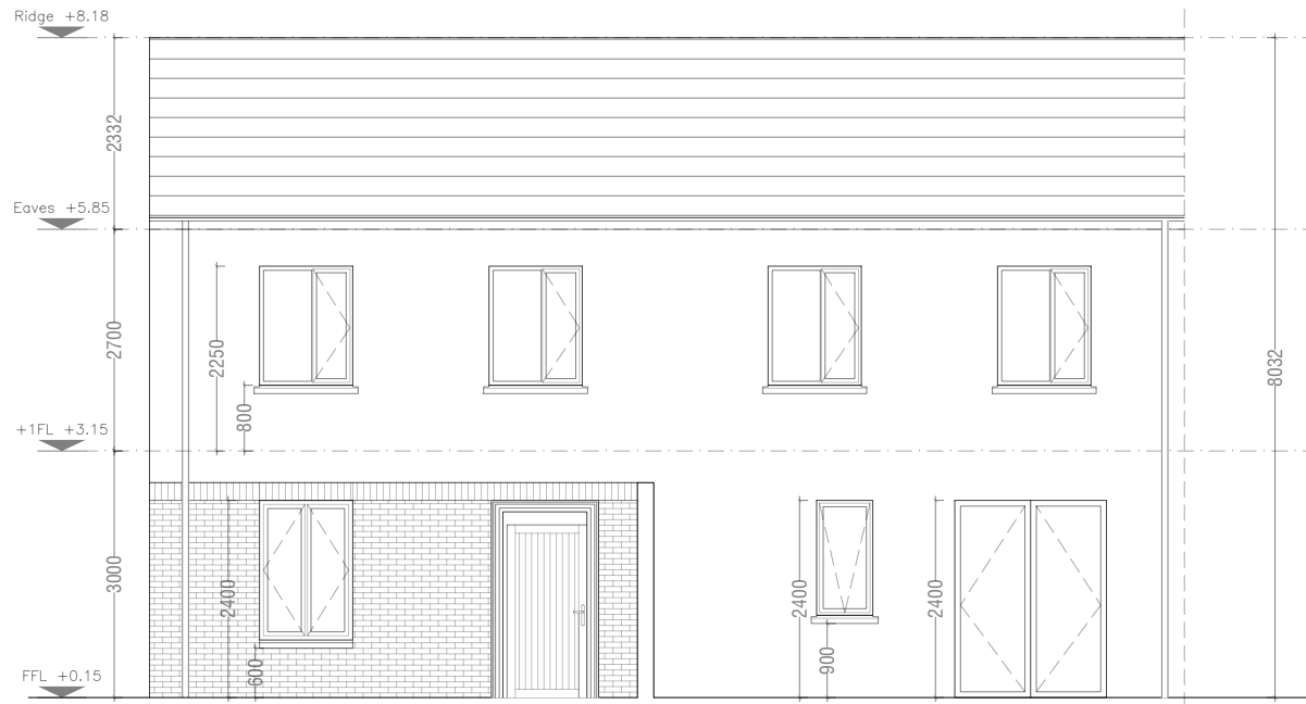
House Type O1/O2 Semi-Detached/End of Terrace Front Elevation