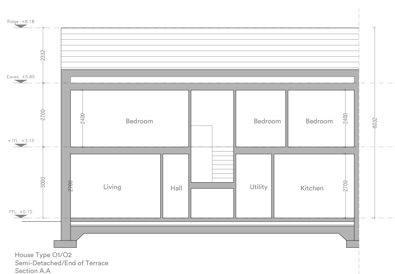
House Type O1/O2 Semi-Detached/End of Terrace Section A.A